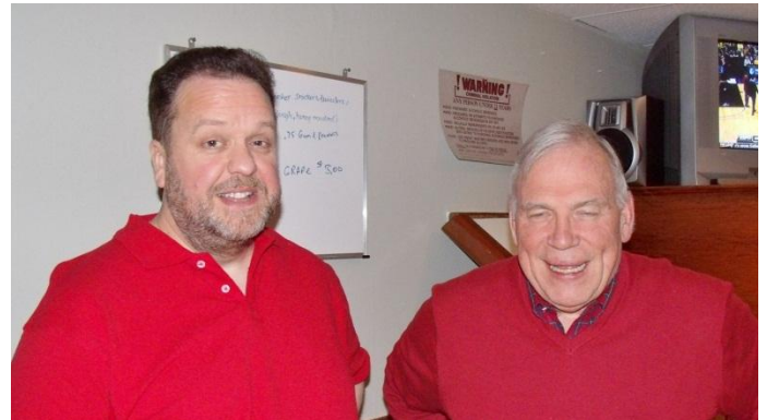
Our Present & Future Financial Secretary